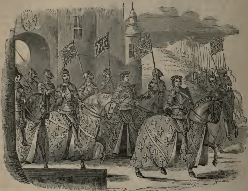
WILLIAM OF HAINAULT ON HIS EXPEDITION AGAINST FRIESLAND. From MSS. of the 15th Century.

beforehand to make the necessary preparations, and to receive his men at arms, and such Hollanders and Zealanders as would be induced to enter his service, and aid him to the accomplishment of his purposes. All the knights, squires and lords in Hainault instantly complied with his request, and promised him their services like loyal vassals. Duke Albert and the count d'Ostrevant found them punctual in the performance of their promises, and they made themselves speedily ready, so that about the beginning of August of the year 1396, they assembled and marched off in companies, handsomely arrayed, towards Antwerp, where they were to embark for Enchuysen, the general rendezvous.